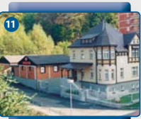
ARREMA S.R.O. P.O. Box 18 - Erbenova 15 466 01 Jablonec Nad Nisou ČESKÁ REPUBLIC