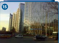
GIACOMINI CHINA Beijing Office Room A801, TYG Centre, No.2 Dong San Huan Bei Lu Bing, 100027 Chaoyang District, Beijing, CHINA