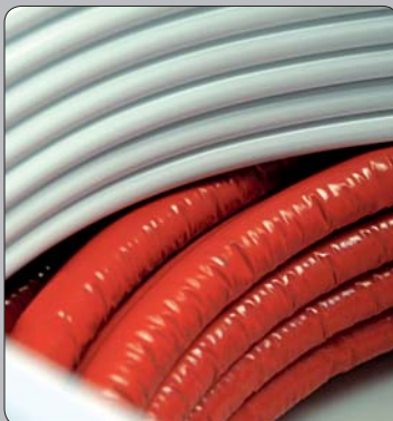
PEX PIPES , PREINSULATED PIPES