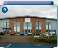
GIACOMINI SALES (U.K) LTD Unit 2 Goodrich Close Westerleigh Business Park Yate South Gloucestershire BS37 5YT UK