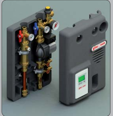
GIACOSUN SOLAR PROJECT AND ACCESSORIES