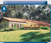
GIACOMINI PORTUGAL LDA. Rua de Martinhaes, 263 4485-188 Gao (Vila Do Conde) PORTUGAL