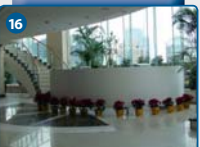
GIACOMINI CHINA Shanghai Office Room 4125, China Development Bank Building, No.500 Pudong Road(s), Shanghai, CHINA