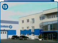
DOMTECH S.R.O. Dolné Rudiny 1 010 91 Zilina SLOVAK REPUBLIC