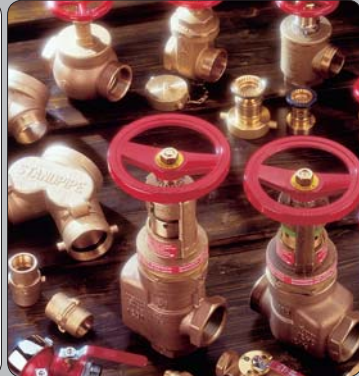
FIRE PROTECTION RANGE OF PRODUCTS UL FM LISTED