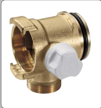
GIACOQEST SYSTEM, PLIABLE SANITARY DISTRIBUTION SYSTEM