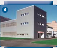
Z- GIACOMINI SA. Via Linoleum 14 6512 Giubiasco (Ticino) SVIZZERA