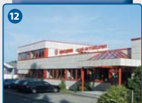
GIACOMINI GMBH Industriestrasse 10 51545 Waldbroel DEUTSCHLAND