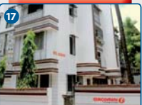
GIACOMINI INDIA G-3, Neel Madhav Nr. Navneet Hospital, V.P. cross road, Mulund (west), Mumbai, Maharastra-400080, INDIA