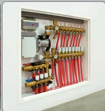
PRE-ASSEMBLED CABINET FOR GIACOKLIMA RADIANT CEILING & UNDER FLOOR