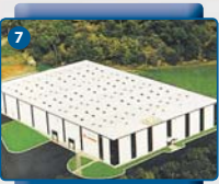
GIACOMINI ESPAÑA SL. Carretera de Viladrau, Km. 10 Poligono Industrial Monmany n. 2 - 08553 Seva (Barcelona) ESPAÑA