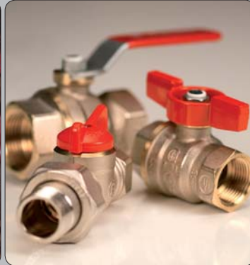
OVER 80 TYPES OF BALL VALVES